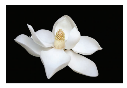
White Flower

that when it is only gold, it has certain potentials. The third Object of the Theosophical Society (TS) speaks of "the